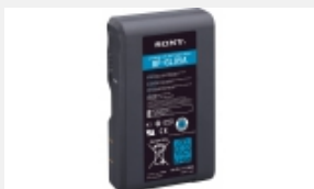
BP-GL95 Rechargeable Lithium-ion Battery Pack