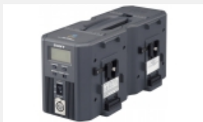
BC-M150 Battery Charger