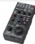
RM-B150 Remote Control Unit