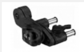
BKW-401 Viewfinder Rotation Bracket