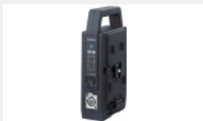
BC-L70 Li-ion Battery Charger