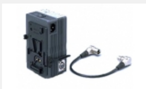
AC-DN2B AC Adapter (150W output) and Lithium-Ion battery charger