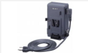
AC-DN10 AC Adaptor/Charger