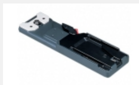
VCT-14 TRIPOD ADAPTOR FOR PORT. CAMERAS/CAMC.